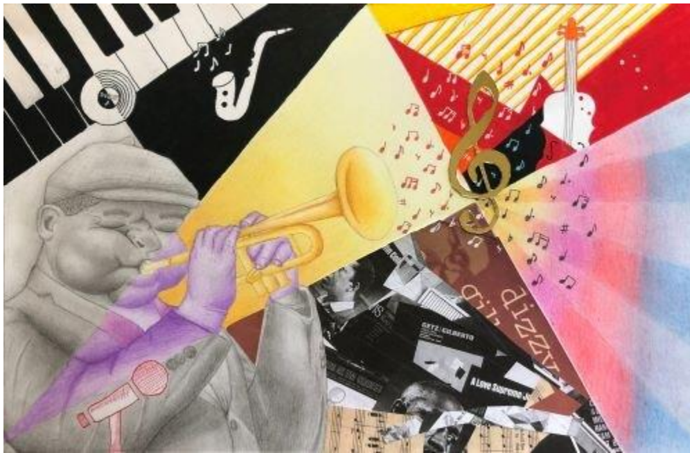
Coyote Junior Maisy Myers