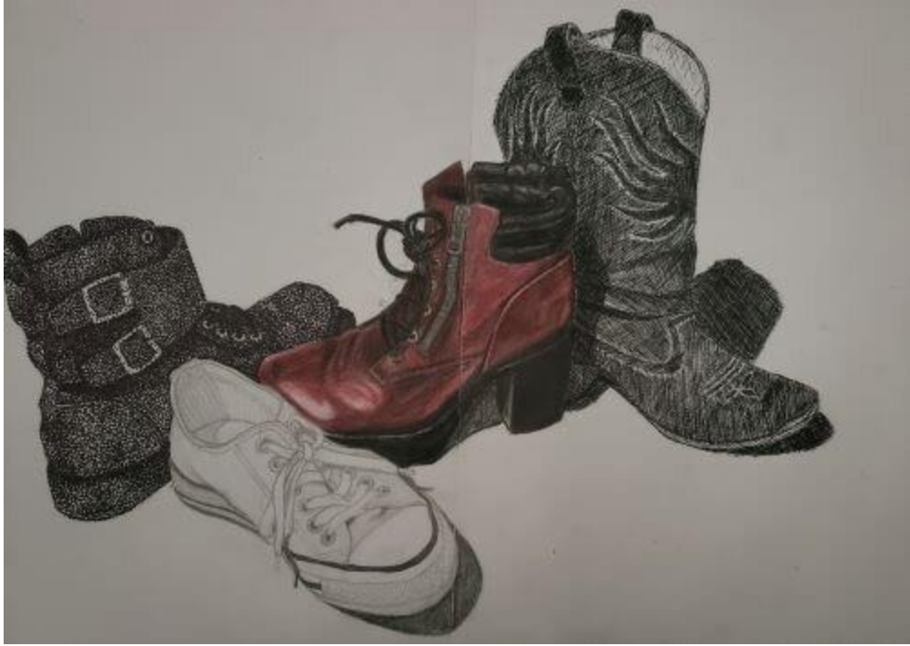
Sophomore Blythe Esquibel